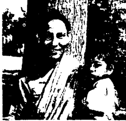
National Family Benefit Scheme