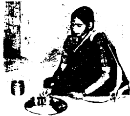
National Maternity Benefit Scheme