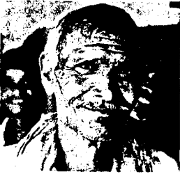
National Old Age Pension Scheme